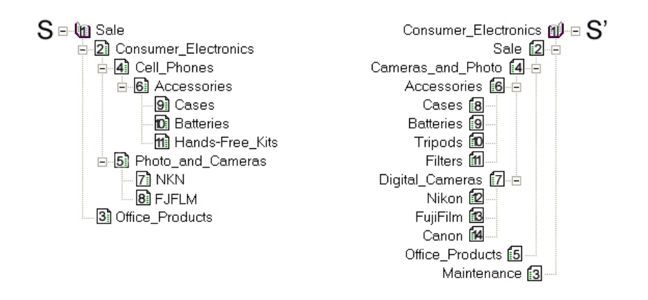
Fig. 1. Two XML schemas

query expressions that automatically translate data instances of these schemas under an integrated schema.