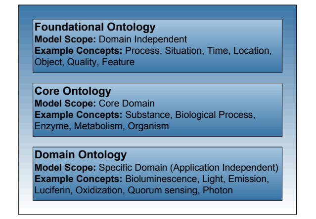
Figure 1. Classification of Ontologies.

Our hypothesis is that the concepts harvested during the ontology engineering workflow should be made available to the Community of Practice for rationalizing semantics based on the experience of actual perceptions that determine knowledge guided by the best practices followed in building foundational ontologies and thesauri. Effectively, top (level) concepts are aligned to concepts in foundational ontology, thus reusing its axiomatic context. In this paper we introduce a novel approach for realizing this hypothesis, which also provides necessary evidence to prove its expedience in ontology engineering. Our approach focuses on helping domain experts, rather than ontology experts, in eliciting domain knowledge by aligning the terminology with the foundational ontology. Helping domain experts through questions and the consequences of their answers, in finding right axiomatic context for the concepts, has resulted in effective semantics interpretation and ontology reuse in collaborative settings. After studying different foundational ontologies [1], we have chosen to use DOLCE in this work.