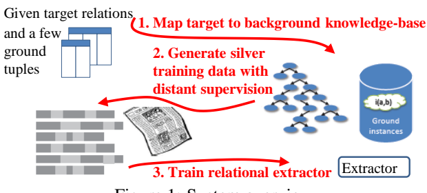
Figure 1: System overview

To address this problem, researchers introduced the idea of distant supervision , a technique for automatically creating training data by heuristically matching the contents of a database relation to text (Craven and Kumlien). For example, if one has a table of athletes and their coaches that included the relation instance (Jelani Jenkis, Urban Meyer), then a system can automatically create a silver<sup>1</sup> training example for isCoachedBy