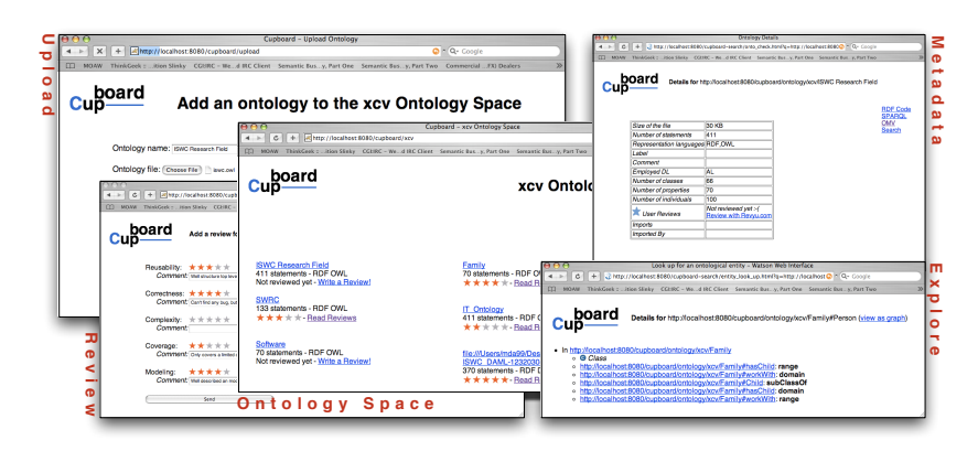
Fig. 1. Screenshots of some components of the Cupboard Web interface.

users. It heavily relies on the Watson engine to provide basic functionalities such as storing the ontologies, indexing them for search, validating them and exposing them to applications. The TS-ORS open rating system, the Oyster ontology metadata sharing system and the Alignment Server each provide specific functionalities to the system, that are federated and exposed in an homogeneous way to the Cupboard Web interface and APIs, through the Cupboard core.