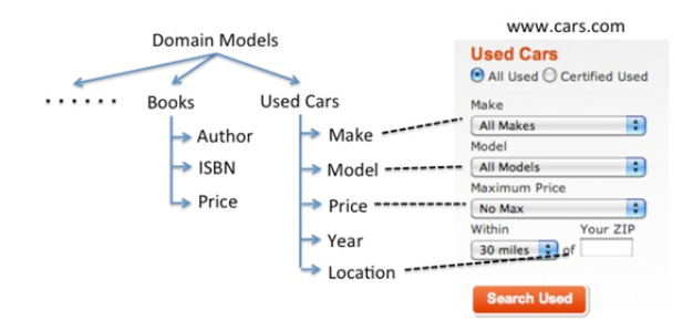
Figure 3 Mappings between domain models and form inputs can be used to automatically fill out HTML forms.

web-form is being matched to a model of user data that is stored in the browser. The user expects the browser to make a best-effort attempt at filling in personal details, which the user confirms before submitting the form for processing.