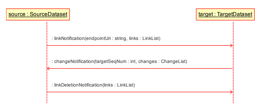
Fig. 6. Subscribing to resource changes in the target data source